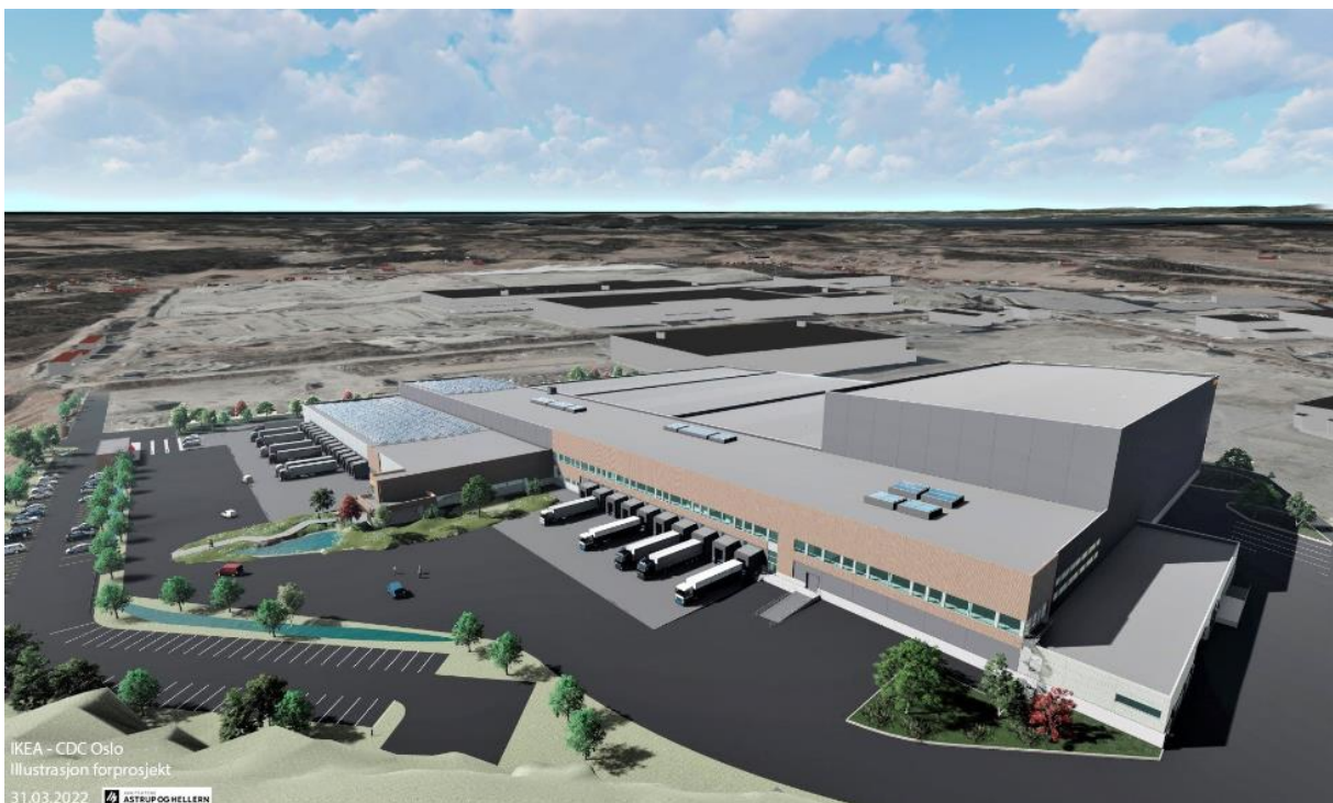
IKEA lager, Vestby, Metacon (steel)

A strategic review of the subsidiary Alento was started in Q2. The outcome of this is expected to be ready in Q4.